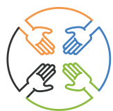
Establishing strong partnerships

The bar graphs below show the percentage of respondents who said “yes” they found success using the identified approach to promote family volunteering.